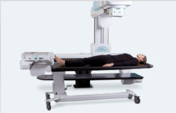
SPECIAL PROJECTIONS ON STRETCHER