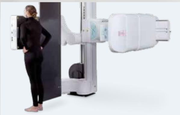
EXAMINATIONS OF THE THORAX AND COLUMN