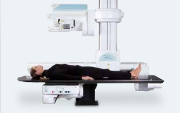
TRANSVERSAL OBLIQUE PROJECTIONS