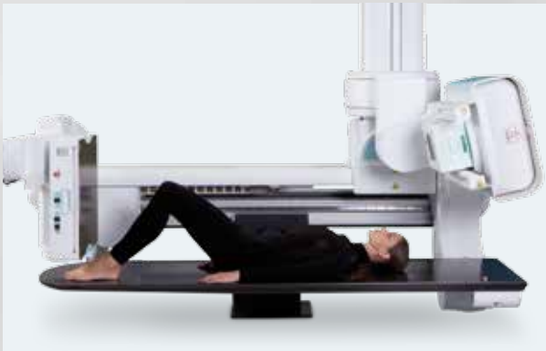
PROJECTIONS IN DIRECT CONTACT WITH THE DETECTOR