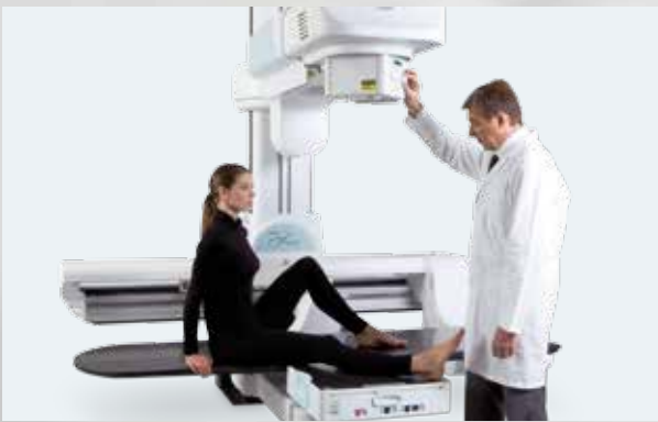
EXAMINATIONS OF THE UPPER AND LOWER LIMBS